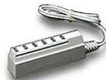
1201-90 SIX LIGHT DISTRIBUTION BOX