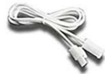
EXTENSION CORDS EXT-01, EXT-02, & EXT-03

Want to make the puck light dimmable? Choose from one of our electronic dimmable drivers below: